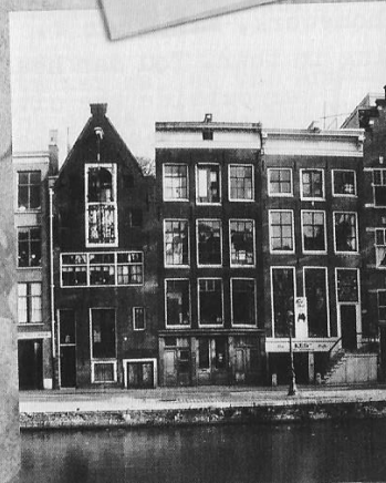
The house in Amsterdam where Anne and her family hid

I am surprised to find that I still believe people are good at heart*. I cannot live a life built on bad things. I see terrible things happening in this world, but when I look up at the sky, I feel that everything will be better one day.