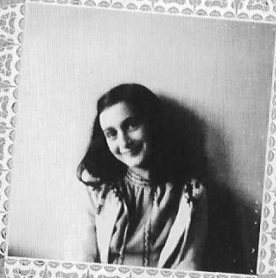
Anne Frank in May 1942