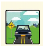
Drive to work