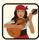
Play the guitar